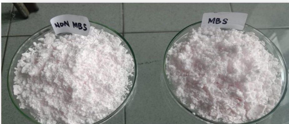
First Manganese Sulphate produced from South Woodie Woodie mineralization.