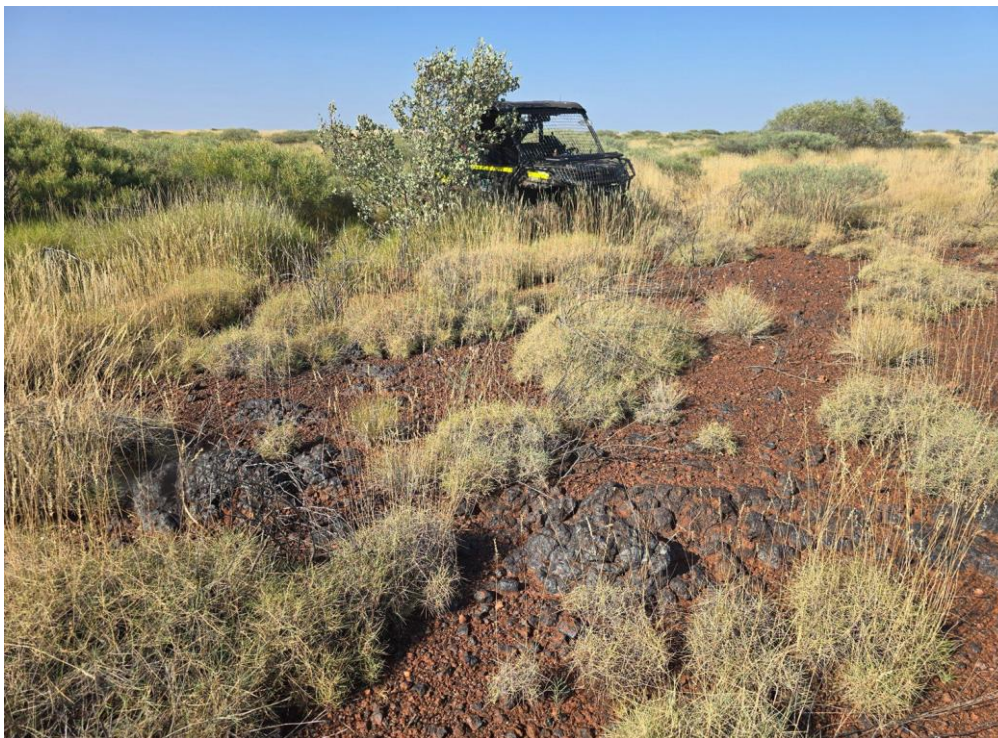
Figure 3. Pothole Prospect: High grade outcrops up to 57% Mn