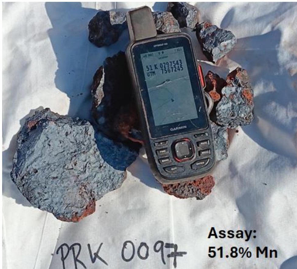
Figure 2. Pearana Prospect: High-grade Mn sample